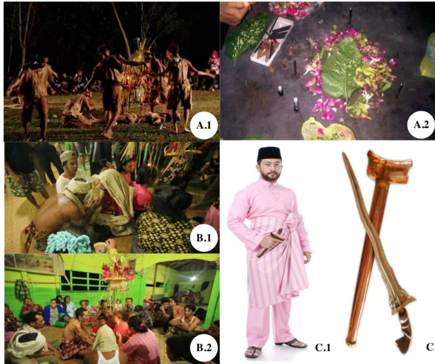
Figure 2. Traditional rituals and treatment methods connected with birds: A. Bubut/Greater Coucal ( Centropus Sinensis Stephens), B. Rangkong Gading/Helmeted hornbill ( Rhinoplax vigil Forster), C. Serindit Melayu/Blue-crowned hanging parrot ( Loriculus galgulus Linnaeus)