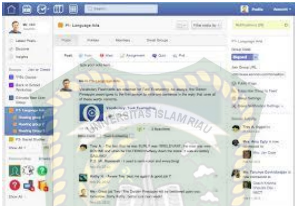
Figure 2.2 Edmodo account

Edmodo is a private social network that is claimed to provide a secure learning platform for learners and educator. Although Edmodo is a Facebook-like tool, it has not yet prevalent for educational usage.