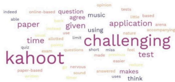
Figure 1. Tag Cloud of Kahoot Vs. Paper-Based Test

The statements and presentations on answers about students’ views in terms of students’ focus are presented in Table 2.