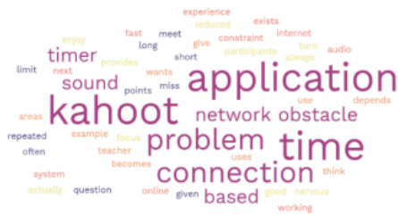
Figure 4. Tag Cloud of The Weakness of Kahoot