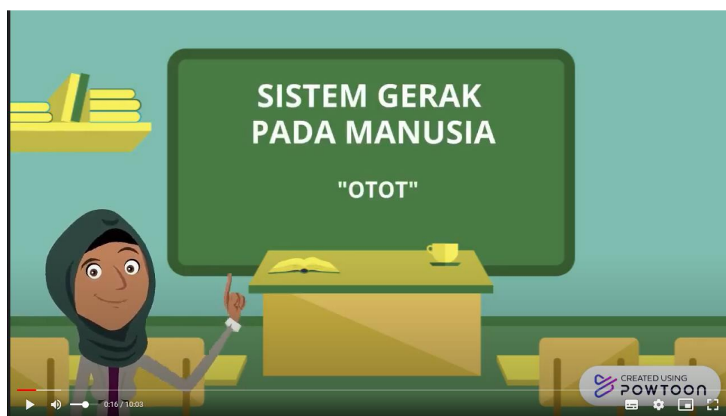
Figure 2. Display of Animation Video Learning Media with the Powtoon Application

Based on Table 2 , it can be seen that the assessment of animated video learning media by media experts has a very valid level of validity. At this stage it is known that the aspect of the state of the device gets a percentage of 93.75%, the display aspect ( Figure 2 ) gets a percentage of 78.57% and the audio aspect gets a percentage of 100%. Overall, the feasibility level for animated video learning media by media experts is very valid with a percentage of 90.77%.