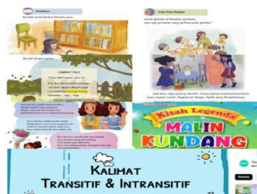
Figure 1. Critical thinking

The results of the researcher's observations were supported by interviews with homeroom teachers at SDN 193 Pekanbaru, which stated that the critical thinking skills of SDN 193 Pekanbaru students at the grade level were different. Lower-grade students are not fully able to develop their critical thinking in learning. In the lower grades (grades II&III), some students immediately understand the material taught by the teacher, but some students take a long time to understand the material. Then, in the high class (IV, V, VI), students' critical thinking skills are quite good; students can think critically in understanding the material and the problems presented by the teacher. In addition, at SDN 193 Pekanbaru, there are also several inclusion students under the guidance of teachers, so these students are not fully able to think critically. In this case, both in the lower grades and in the upper grades, teachers always try to help students develop their critical thinking skills.