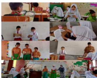
Figure 2. Communication

The results of the researcher's observations were supported by interviews with homeroom teachers at SDN 193 Pekanbaru, which stated that students could communicate with the people around them; teachers also said that students are accustomed to using Indonesian in communicating. The use of language by students is also good, but some students are still not evident in reading. Thus, it can be concluded that the communication skills of SDN 193 Pekanbaru students are quite good, students have communication skills. Although at SDN 193 Pekanbaru, there are still inclusion students with a sense of nervousness and minor stuttering in communicating, this is not a barrier for students to speak in the learning process. Teachers, such as homeroom teachers, always guide and teach students to communicate well and politely.