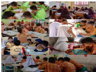
Figure 3. Collaboration

during discussions. The collaboration ability of SDN 193 Pekanbaru students can be described as the ability to collaborate, respect each other, and take responsibility as a group for the assignments given by the teacher. First, collaborating, based on the observation of SDN 193 Pekanbaru students, both in the lower and upper grades, students are very enthusiastic if asked to collaborate; SDN 193 Pekanbaru students can collaborate with their friends. Second, respect each other; during the learning process, students of SDN 193 Pekanbaru are always taught to respect each other. However, in collaborative activities, the researcher observed that students had not shown seriousness in learning; they talked more and joked with their group friends. Third, responsible for SDN 193 Pekanbaru students could complete group assignments. This statement aligns with the results of interviews with homeroom teachers at SDN 193 Pekanbaru, who stated that students can learn to collaborate but still need to be guided so that discussion activities run orderly. In this case, the teacher constantly evaluates the activities that have been carried out; the teacher also always establishes a good relationship with all, instills an attitude of mutual respect for differences, does many activities in groups such as discussions and other activities so that students have good collaboration skills with their friends.