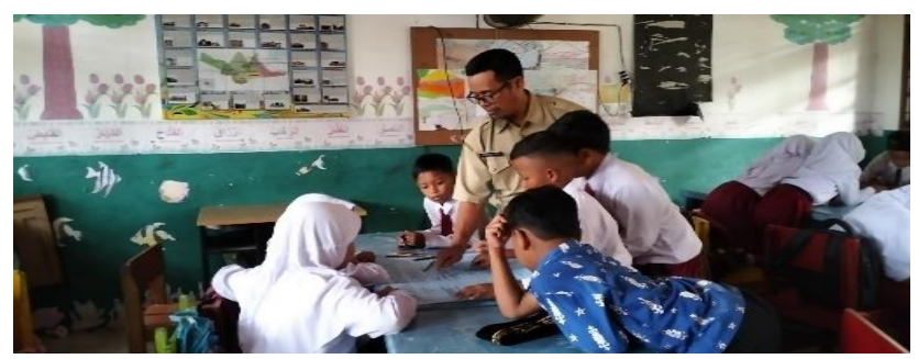
Figure 2. Students do discussion group

dynamics of collaborative engagement appear to encourage even the most reticent students to take an active role. The interplay of group interactions serves as a catalyst for participation; for instance, when a group leader offers input or suggestions, it sets a precedent that encourages other group members to contribute as well. This is not merely about the exchange of ideas but also about the creation of a supportive environment where students feel valued and heard. The active participation engendered by this setup demonstrates a crucial point: that the physical arrangement of the classroom and the structuring of activities can significantly impact students' willingness to engage and their confidence to express themselves. Through these group discussions, students are afforded the opportunity to voice their thoughts and ideas, receive feedback, and interact with their peers in a constructive manner. The resulting increase in self-confidence stems not only from the act of participation itself but also from the recognition and affirmation of their contributions by their peers and instructors. This evidence suggests that thoughtfully designed seating arrangements and structured group activities are key to creating an inclusive and empowering learning environment that nurtures students' self-confidence.