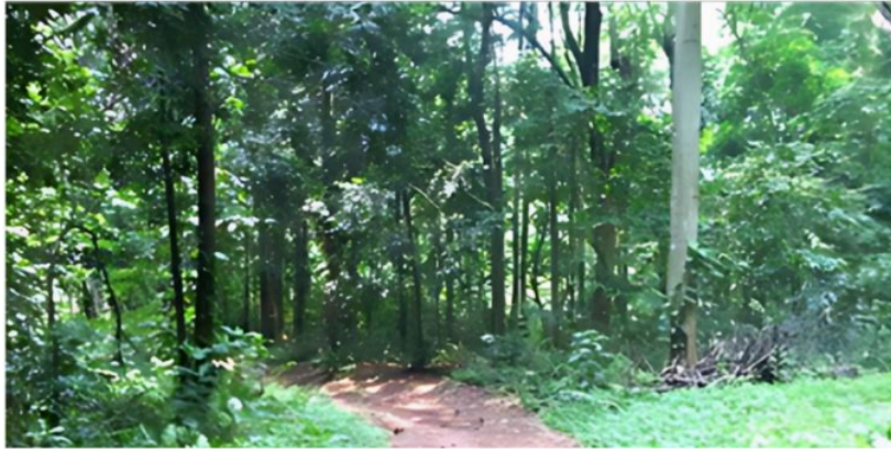
Figure 4. Campuran agroforestry system in Kepulauan Meranti District.