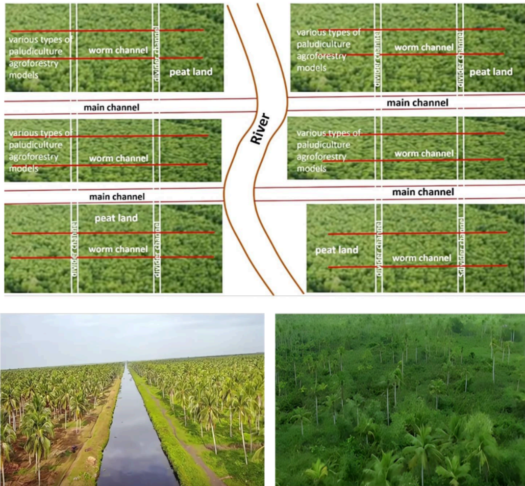
Figure 8. Hydrological system model of peatlands which are used for various types of paludicultural agroforestry in Indragiri Hilir District.