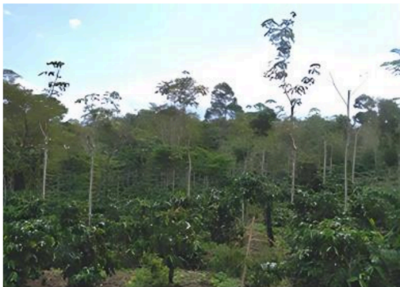
Figure 3. Kobun agroforestry system in Kepulauan Meranti District.

Agroforestry practice of the parak type is frequently observed within Riau Province, specifically in Kampar Regency and Kuantan Singingi Regency. Under this system, annual crops are grown in combination with trees that are diligently managed and periodically harvested. The parak agroforest typically includes six types of trees, namely durian, Liberica coffee, robusta coffee ( Coffea robusta L. Linden.), surian, bayur, jengkol and petai. Additionally, it incorporates corn and cassava, as well as vegetables such as chilli pepper ( Capsicum annum L.), cucumber ( Cucumis sativus L.) and eggplant ( Solanum melongena L.), medicinal spice