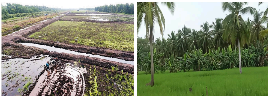
Figure 9. Parit Kongs in Indragiri Hilir District.