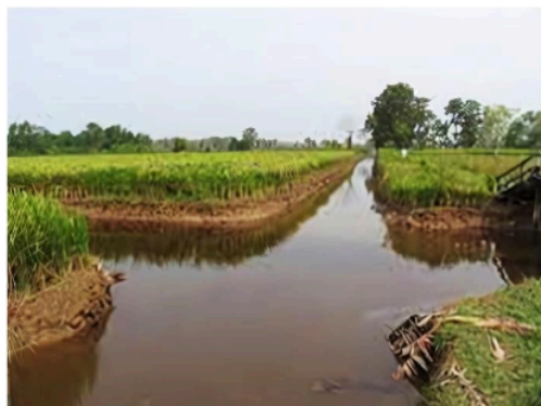
Figure 10. Handil in Kepulauan Meranti District