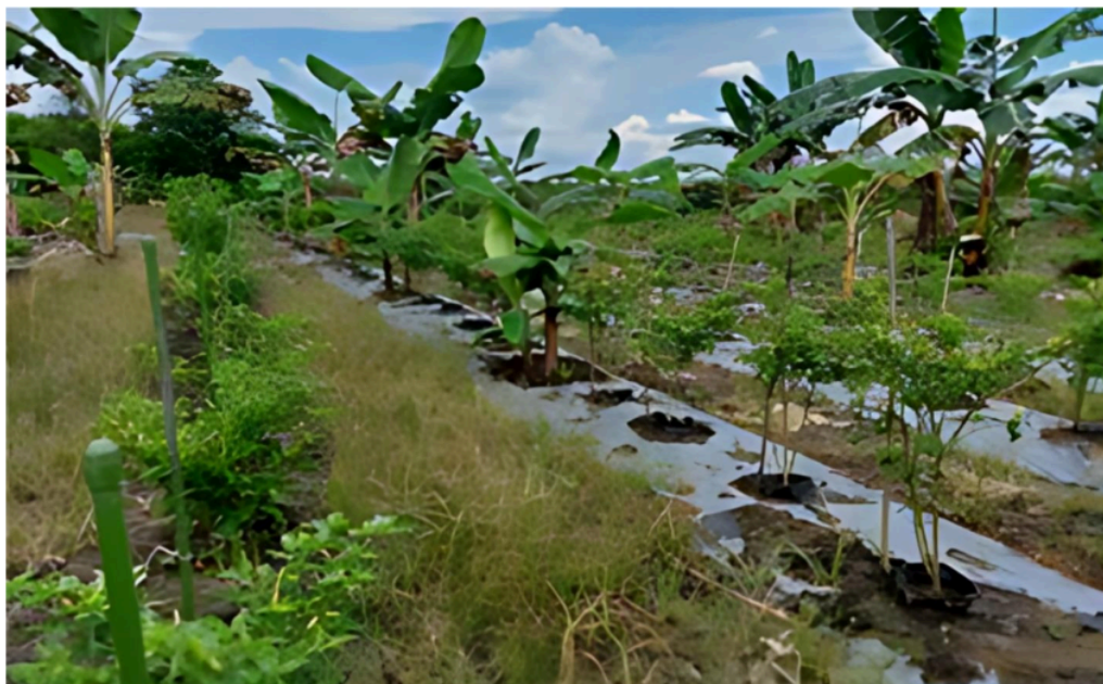
Figure11. Sisir agroforestry system in Kepulauan Meranti District.