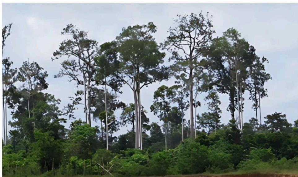
Figure 2. Kepungan sialang forest in Kepulauan Meranti District.

The kobun system (Figure 3) is based on trees such as surian ( Toona sinensis Roem), bayur ( Pterospermum javanicum Jungh.), gelam ( Melaleuca leucadendron Linn.), mahogany ( Swietenia mahagoni (L.) Jacq), sengon ( Paraserioanthes falcataria L. Nielsen) and sungkai ( Peronema canescens Jack) which will be processed into wood for carpentry, buildings and furniture with high selling value. Various types of fruit are also cultivated: durian, sapodilla ( Manikara zapota L.), rambutan ( Nephelium lappaceum L.), mangosteen ( Garcinia mangostana Linn), sweet orange ( Citrus sinensis L.), pisang kepok ( Musa acuminata balbisiana Colla), papaya ( Carica papaya L.), jengkol and petai, thus forming a pattern combining wood-producing trees with fruit trees. The main plant grown on garden land is rubber.