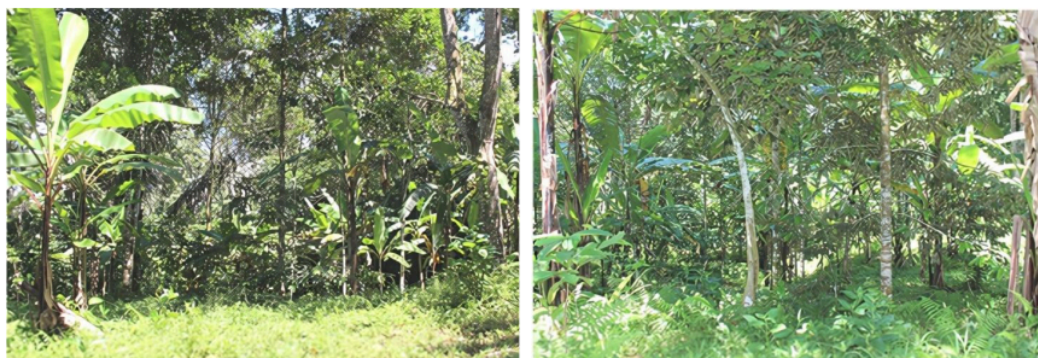
Figure 7. Parak agroforestry system in Kepulauan Meranti District.

The system known as anjir integrates agricultural land on both banks of two major rivers. As in the handil system, land situated on both the left and right riverbanks has been transformed into agricultural land. The construction of the anjir is expected to have a positive effect on water management in the surrounding area, particularly in relation to its suitability for rice cultivation. Subsequently, a considerable number of individuals have autonomously established rice fields in the vicinity of the anjir canal, leading to its gradual transformation into a residential zone. This phenomenon is particularly prominent among farmers who engage in agricultural activities inside the rice fields around the anjir wetlands. In addition to rice, fruit plants such as pineapple, banana and watermelon are cultivated, as in the practice of handil . The embankments of rivers are commonly planted with various vegetable crops including chilli pepper, cucumber, eggplant, tomato ( Solanum lycopersicum Mill.), shallot ( Allium cepa