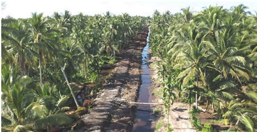
Figure 6. Sabuk in Indragiri Hilir District.