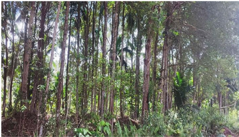
Figure 5. Jalur in Kepulauan Meranti District.