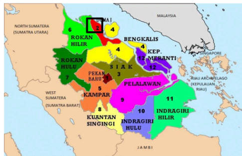
Figure 1. Research location

The research was carried out on well-X rig, well-Y rig and well-x rig located in the working area of PT. PHX in Riau Province as in Figure 1.