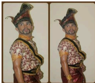
Fig. 6. Laman Silat Dance Make-Up