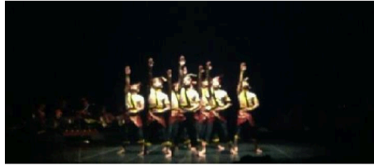
Fig. 1. Sujud Syukur (praying) movement

The Gelanggang Latihan movement represents the process of silat training under the guidance of a teacher, represented by a dancer in the center of a semi-circular formation with seven other dancers, as can be seen in Fig.2. This movement tells the story of the interaction between teacher and students in silat training, where the teacher demonstrates silat techniques, and the students observe. In the Gelanggang Latihan movement, the 'Kontras' occurs at 2:22 with two focal points: The first group of 4 dancers moves at high and medium levels at a fast tempo. The second group of 4 dancers moves at a low level with a medium tempo, then changes to a fast tempo with a change in facing direction, but the level remains. Then, the unison returns at 2:35. The next 'Kontras' occurs at 2:44. The eight dancers are divided into two focal points: 1 group of 2 dancers roll in a seated position apart from the other six dancers; two dancers perform low-level movements at a medium tempo, while six dancers perform high-level movements at a fast tempo. Then, the unison returns at 2:48. At 2:49, another 'Kontras' focuses on 3 points on a right diagonal line. Group division: 3 : 3: The group of 2 dancers at the front moves from fast to slow tempo, and the three dancers in the center move from slow to fast tempo. The other three dancers at the back move staccato. Then, in unison again at 3:06.