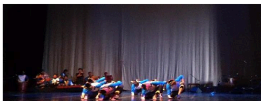
Fig. 4. Kembali ke Yang Satu movement