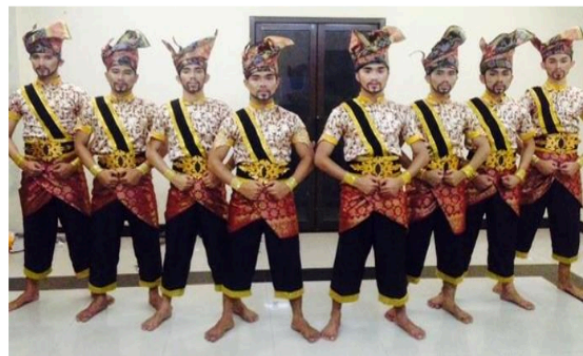
Fig. 5. Laman Silat Dance Costume

Dance costumes contain the theme of the dance work, the characteristics of the fashion design, the dancer's movements, and the lighting effects. Factors such as line, silhouette, color, material, and lighting have an influence on dance costumes and reflect the character and image of the dance [36]. Laman Silat's stage costume includes basic clothing, footwear, headwear, and accessories. This costume (Fig. 5) consists of a headband, a heart-red shirt with short sleeves and motifs, black \frac{3}{4} length trousers with gold applications, and a black-red tanjak with black bengkung . The use of red, black, and gold colors reflects Malay culture's bravery, gallantry, and beauty. The costume is carefully designed, with gold applications on the cuffs, collar, and trousers to give a formal impression. The \frac{3}{4} length trousers were chosen to allow the dancer to move freely in the silat performance. The red heart side cloth and black bengkung with gold bis are also used to give a strong impression. Overall, the costumes of Laman Silat dancers reflect the great Malay cultural heritage, combining the gallantry of silat and the beauty of Malay culture in one performance. Lexicon in dance costumes, such as head, neck, hand, body, and foot costumes, have cultural meanings [37].