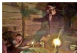
Figure 1. Bedikie .

Bokuan ritual carried out by the people of Tanjung Padang, Kepenuhan District, Rokan Hulu Regency, Riau Province has been existing in the community since 1962. The absence of hospitals, health centers, and other treatment centers forced the people to use Bokuan as a method and attempt to cure diseases. To this day, this ritual still becomes an alternative option since it is considered an effective treatment, although the people also visit doctors. The next ritual is called Talam Dua Muka . It is a custom in Teluk Setimbul Village that still exists to this day. Cabut Kelo is a healing treatment applied when the patient's family gives consent. There should be no coercion in this treatment. The last one is Buang Badi . This ceremony aims solely at curing illness. It can be carried out either at the patient's house or the shaman's house.