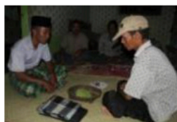
Figure 2. Menyimab .