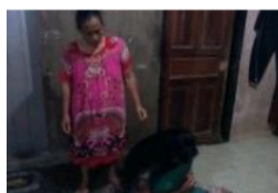
Figure 4. Cabut Kelo .