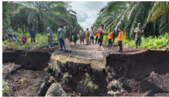
Figure 2. Abrasion on Bengkalis Island resulted in damage to infrastructure such as roads

The abrasion on Bengkalis Island has caused severe damage to the infrastructure, especially the roads around the island. Abrasion is the process of beach erosion or erosion caused by sea waves, tides, and other natural factors. Bengkalis Island, located in Riau Province, Indonesia, is vulnerable to abrasion impacts due to its position by the sea. The impact of abrasion on infrastructure, especially roads, is very significant. Strong and continuous sea waves hit the island's shoreline, gradually eroding the soil and sand. As a result, the roads built along the coast and close to the shoreline suffered severe damage. The road surface became uneven, cracked, and, in some cases, even destroyed.