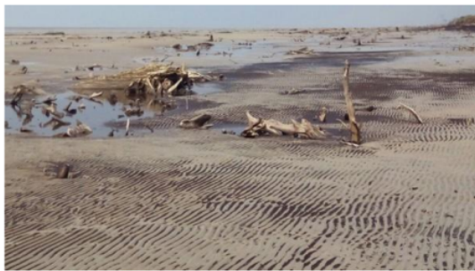
Figure 1. Abrasion on Bengkalis Island

The 69,000-meter-long abrasive beach in Bengkalis Regency carries a significant risk. The following is an empirical description of the impact of abrasion seen in Figure 1.