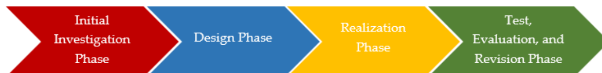
Figure 1. Plomp Development Model by Plomp (2013). Inspiration Flowchart by Thalbah et al. (2022)

This research is a development-research that aims to develop numeracy literacy instruments based on computational thinking in mathematics learning. This research uses the Plomp model because this model provides a systematic and structured approach to the process of developing educational instruments. By following this model, this research can ensure that the instrument developed not only fits the learning needs but also meets the quality standards required to improve students' numeracy literacy through the computational thinking approach.