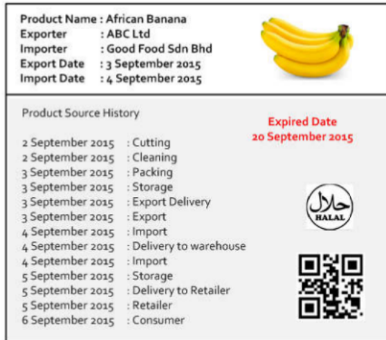
Fig. 3. Example of screenshot display on consumer smart devices for product details.

Smart consumer is normally very selective in food product either kind of product of source of the food comes from. Nowadays, most of customer is holding smart devices for communication, take note, photos, etc. thus with smart and mobile devices has ability to retrieve information all the history and journey of an item then consumer will get idea and decision whether kind of product safe to consume or not. Many cases happen in develop countries that the customer with low knowledge about food product then consume unsafe or unhealthy product even in expired date then caused dangerous for the body. As we seen on the news case of unsafe food product keep happen, this is also caused because of some party of people takes chances from this food trading, by selling or export rejected product that supposedly to destroy, then rejected product go to customer does not know about good food.