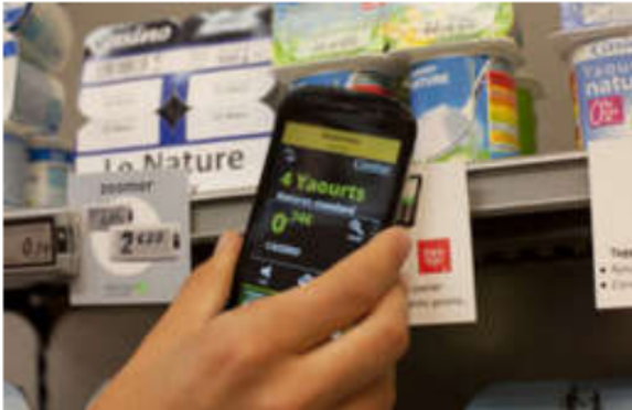
Fig. 2. Traceability system architecture based on the EPC Global standard network

required high attention to ensure that item in correct thing due to many similar objects. Increasing and spread up of fraudulent and counterfeit food product has become an issue across all industries and the globalization in supply chain management system then risk for consumer. Fraud of food product takes seriously impacting on the performance and reliability and reputation also financial losses for the supplier. In the supply chain system, traceability is a solution to verify product detail or location by applies identification of item that documented (recorded) in previous system. Implementation of product identification and traceability system especially in food product ability to eliminate of fraud and counterfeit items, then provide safety, affordability, and improve health of product that consume by human. There are several techniques to identification of food product and the common system used is Bar Code System and RFID. Evolution of mobile device such smart phones or tablet has enable to build in RFID system which is NFC reader. Identification of food product is come to simple way and ability to do by develop application software for mobile devices then by scanning to the product and all the information is appear on display that previously recorded. Figure 2 shows an example of identification process food product in shopping complex, while consumer just tapping or scanning to one of product to know the product detail or processor history: