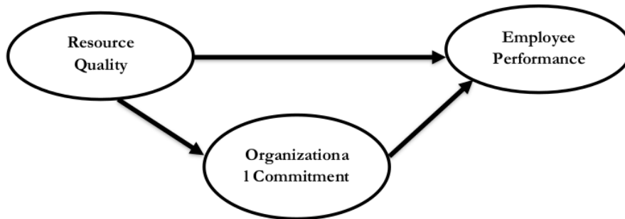
Figure 1 Research framework