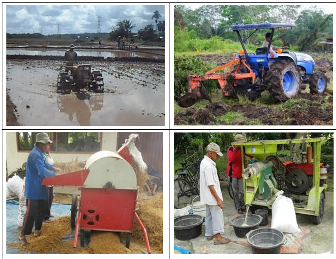
Figure 3. Operators operating farm machines in Riau Province

The operator must also think about how to maximize the power and performance of the farm machine and save fuel. In addition, machine operators need troubleshooting skills. If the machine is not working correctly, the machine operator must be able to find the source of the problem and fix it. This ensures correct and efficient operation of the machine in the future. In addition, the machine operator can inspect and identify possible defects or inconsistencies in the machine. Therefore, quality control is also necessary so that the operator can identify opportunities to improve operational processes and increase efficiency.