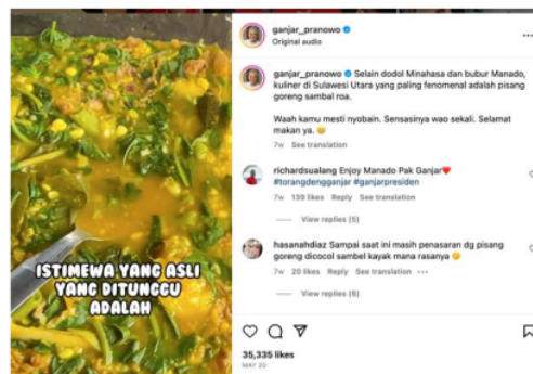
Figure 1. Ganjar's Post, May 20, 2023

Ganjar is engaged in visiting many areas of Indonesia as part of his political campaign. On May 20, 2023, he posted about his travel to Manado. As usual, Ganjar wrote in Javanese and said nothing more than that the local specialties, dodol and porridge, were excellent. The image demonstrates Ganjar's enjoyment of dining and socializing informally at the seller's home. The human character predisposes himself to act in particular ways, but in reality, he just reacts to a