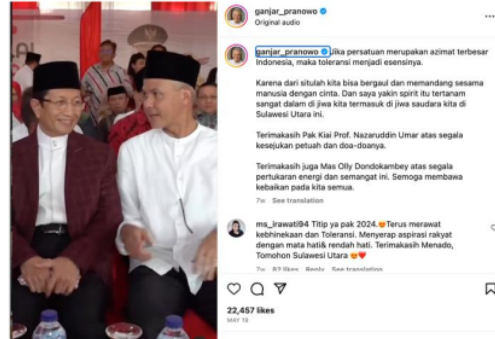
Figure 2. Ganjar's Post, May 19, 2023

Ganjar's post on May 19, 2023 above is a manifestation of Ganjar's actions in building diversity in Indonesia. As a Muslim, Ganjar has displayed it perfectly with various symbols attached to him, for example white koko clothes, black caps, Islamic boarding school environment, and interactions with Muslim scholars in Indonesia. The interweaving of these concepts gives complete meaning to the representation of one's piety in the context of Islam, which is the majority in Indonesia.