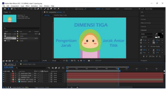
Figure 3. (Prototype 2) Opening Character of The Distance Between Points on Prototype 2 And Using Eras For ETC Fonts

The last part is design changes such as font colors and backgrounds that are tailored to the needs of the animation video. The font and background colors are not suitable because there are too many colors that will make students who watch them become unfocused with the content of the animated video. After receiving and making improvements to the revised animated video, improvements to prototype 1 that have been developed can be referred to as prototype 2.