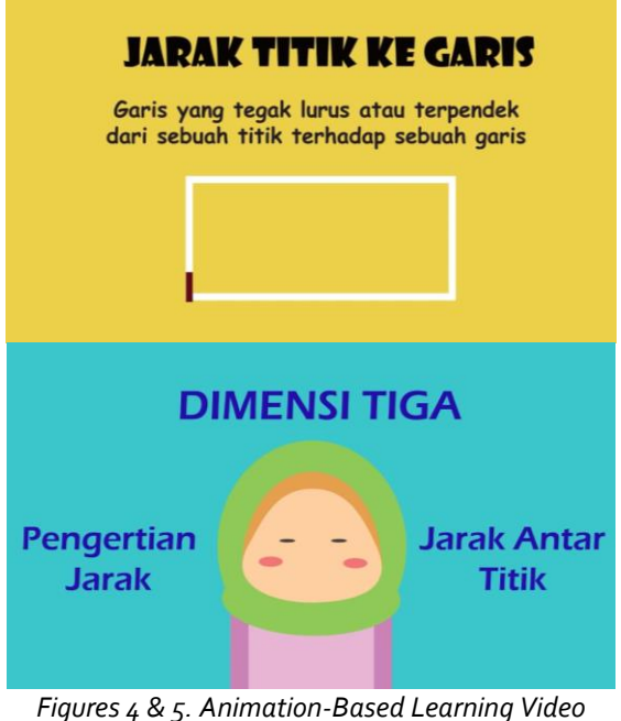
Figures 4 & 5. Animation-Based Learning Video Results

tools because they can have each of them. In addition, this learning media are also easy to obtain and can be seen repeatedly anywhere and anytime, which can make students' mathematical literacy increase and can make students' imaginations develop. In the long term, students are expected to have their own interest in learning mathematics. As a result, students realized that learning mathematics was no longer considered a difficult and rigid subject that dealt with numbers and numbers alone. But on the contrary, mathematics is one of the memorable subjects and can also be learned through media and applications as a group of other subjects that are not only struggling in books and struggling with formulas.