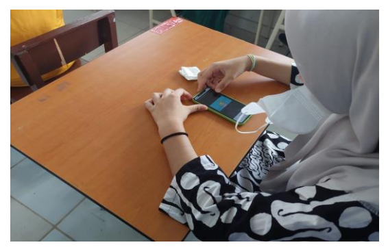
Figure 4. Students Watch Animation-Based Learning Videos

Furthermore, at the assessment stage, a trial will be carried out on prototype 2 to find out the practicality and effectiveness of animated video-based learning media. In this assessment phase, there are two stages of trials, namely limited trials, and extensive trials. First, a limited trial was carried out by providing animated videobased learning for 10 students of class XII MIPA 1 on August 9, 2022. The purpose of the limited trial to 10 students is to see the practicality of learning media developed in a limited scope through a response questionnaire that will be filled in. In the limited trial, 10 students were allowed to watch three animation-based learning videos.