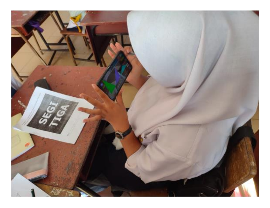
Figure 2. Experimental class learning process

AR is a form of human and media interaction that brings new experiences to its users. The virtue of AR is that AR can cause animated picture effects in the real world. Augmented Reality has advantages as an educational medium. It has been proven in this study that this technology has a considerable influence on increasing students' mathematical critical thinking skills who receive learning using augmented reality media with Unity 3D based on students' initial mathematical abilities. The following is the process of implementing and answering student test results in the experimental class: