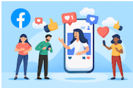
Cover Image.png 2313K