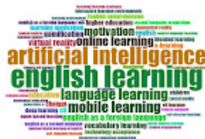
Cover Image-Sri Wahyuni et al.jpeg 358K