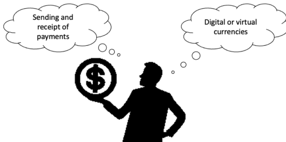
Figure 5. Trafficking financial management engaging in technology

The final dimension on the role of technology in facilitating trafficking in persons is the financial management, in which monetary funds and payments are sent and received using online banking and at certain points, involve digital or virtual currencies as shown in Figure 5 below.