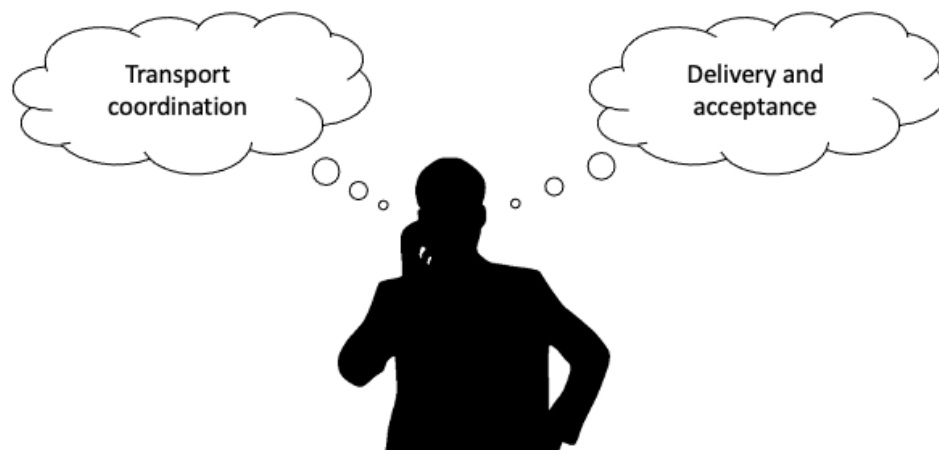
Figure 3. Role of technology to facilitate transportation of trafficking victims

Transporting trafficking victims from their home country to the destination, whether by road, air, or sea, is the second dimension of the problem. Using each of these means of transportation would necessitate delicate communication and collaboration among the persons involved, and they would be forced to rely on technology equipment and gadgets, as well as communication channels, in order to coordinate their efforts, as shown in Figure 3 .