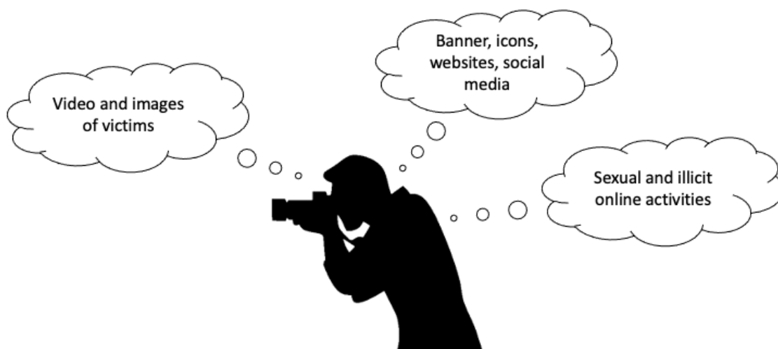
Figure 4. Technology in exploitation of trafficking victims

The third dimension is for the purpose of exploitation itself, i.e. for the purpose of carrying out the exposing, exploitation, and weakening of the victims, for which technology tools are also widely employed and prevalent, some of which are highlighted in the following Figure 4 .