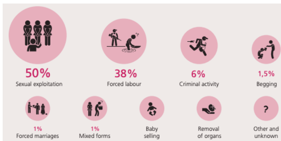
Figure 1. Forms of trafficking victims by type of exploitation (UNODC-United Nations Office of Drugs and Crimes, 2020)

Figure 1 shows the forms of trafficking victims by type of exploitation. Top of the list is sexual exploitation of the victims by 50%, followed by 38% of cases involve in forced labour. Meanwhile, 6% of the cases are in the form of criminal activities, followed by begging (1.5%), forced marriages (1%), mixed forms (1%) and others. This proves the various and diversified forms of exploitation involving victims of trafficking in persons.