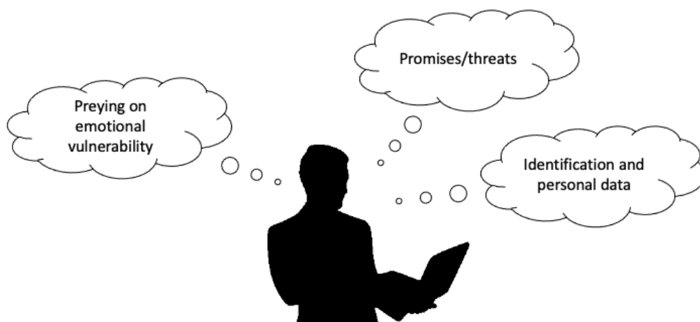
Figure 2. Recruitment and advertisement for trafficking purpose

The first dimension is for the recruitment and advertisement by perpetrators and targeted towards the potential victims. Wide variety of media was used to reach to the potential victims, to identify the likelihood of the persons susceptible to become victims and to communicate with them, such as telephone calls, emails, social media, and even printed materials. The role of technologies in facilitating trafficking in persons is described in the following Figure 2 .