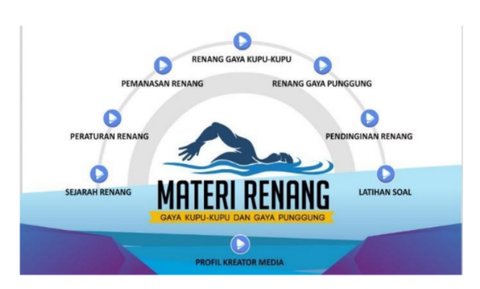
Figure 5. Display of the Swimming Materials Menu

Figure 3 shows the application before opened, while Figure 4 shows the initial picture when it's opened, and Figure 5 shows the display menu of swimming materials where we can find out the history of swimming, swimming rules, swimming warm-up and then how swimming butterfly and backstroke.