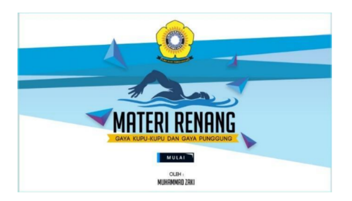
Figure 4. Initial Display