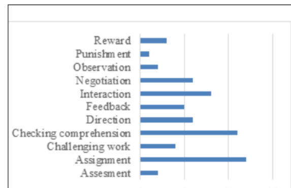
Fig. 2. Students' proposed activities in monitoring process

Eleven activities are proposed during the monitoring process in the classroom. Students suggest the following activities, from the most involved activities, namely having assignments, checking their understanding, having interaction, getting direction, getting feedback, getting a challenging work, knowing the reward, getting observation, having assessments, and knowing the punishment or the consequence of being involved or not during the learning process (see Figure 2). In