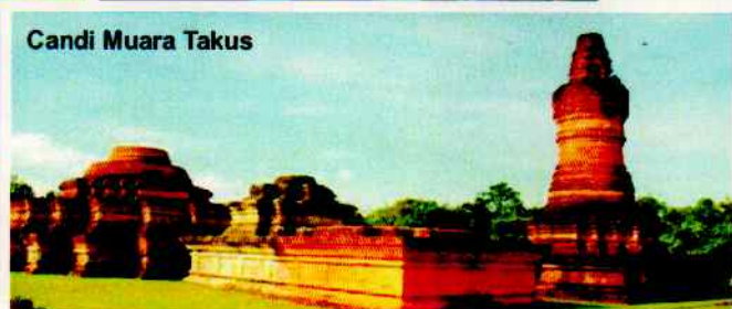
Candi Muara Takus