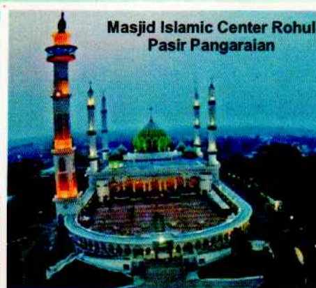
Masjid Islamic Center Rohul Pasir Pangaraian