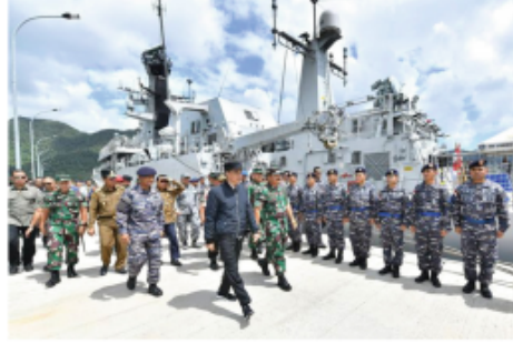
Fig. 2. Indonesian integrated military base.

law. The Indonesian government is making efforts to maintain the security of the Natuna waters, the Indonesian government is making deterrence efforts by threatening China that Indonesia will not hesitate to arrest foreign ships that enter illegally into Natuna waters. The Indonesian integrated military base show in Fig. 2.