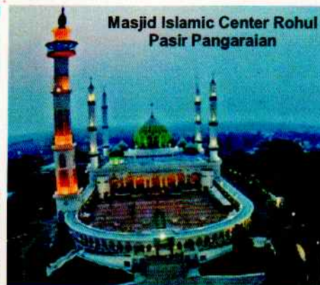
Masjid Islamic Center Rohul Pasir Pangaraian