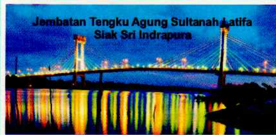
Jembatan Tengku Agung Sultanah Latifa Siak Sri Indrapura