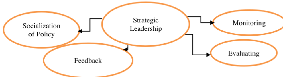
Figure 3: Schematic of the Strategic Leadership Capacity of the Village Government in the Stunting Convergence of the Village Sinaboi

elements of the village government and elements of the village community (Rauf and Maulidiah 2015).