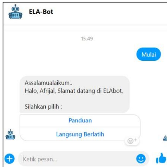
Fig 2. ELA-bot's initial response