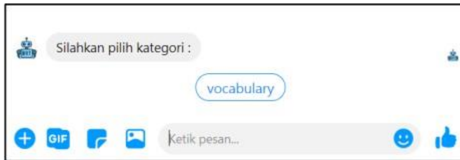
Fig 3. ELA-bot practice guide

The practice guide is shown in Fig 1 and the option to start practicing is shown in Fig 2. Practice there is an option to select a category. Then the practice questions that must be answered will be displayed. The guide as shown in Figure 8, contains an explanation for choosing one of the question's practice categories, the user gets a question with a level according to the selected category, a guide to choosing the right answer, and a notification when you finish doing the exercise, the result of the practice score will appear. If the score result is more than or equal to 80, then the user is in the level-up category and if the score result is less than 40, then the user is in the drop-level category. When the user selects the "practice immediately" button as shown in Fig 2, on the display A conversation appears to select a category, for example, the category "vocabulary". After selecting a category, there will be practice questions that must be answered as shown in Fig 3, 4, and 5 below.