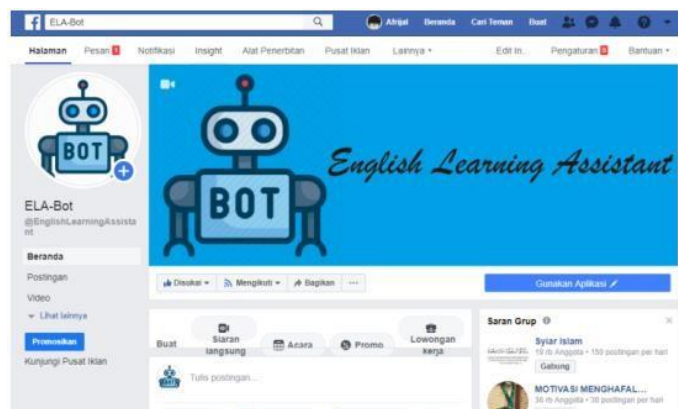
Fig 1. Facebook ELA-bot page

Based on the applied algorithm users can access Facebook messenger. Then search for the ELA-bot page and use the application. The ELA-bot page is shown in Fig 1. Once the conversation box opens, click the start/start button on the conversation. ELA-bot's initial response contains a greeting accompanied by the login user's name and a command to choose between opening the guide or practicing right away with the click of each option button. As shown in Fig 1 below.