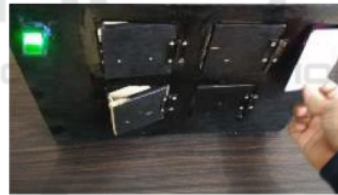
Figure 4: Testing RFID

The testing step is to attach the RFID card whose data has been registered in the system so what happens is that the RFID sensor successfully reads and identifies the appropriate data, the solenoid that was in a defective position or closed will be active so that the door can be opened.