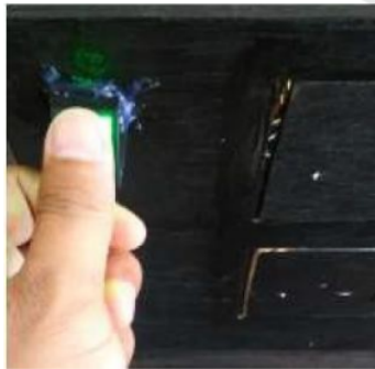
Figure 3: Embedding Process