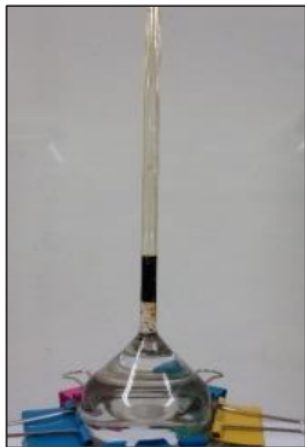
Figure 2. Oil accumulation in spontaneous imbibition cell

highest recovery factor was found when the concentration of Mg^{2+} was 20 ppm in SW z. However unlike Ca^{2+} , low concentration of Mg^{2+} did not always proportional with good oil recovery. In this study, 20 ppm Mg^{2+} in the SW x resulted in the lowest recovery factor compared to SW y and z.