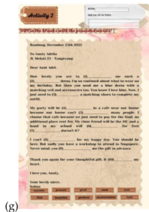
Figure 1. LiveWorksheets-based interaktif LKPD. (a). cover of e-student worksheet, (b). intructions, (c). basic competence, (d) material 1, (e). material 2, (f). Assignment1, (g). assignment2.

In answering the exercise questions, students are presented with a range of options designed to accommodate different learning styles and abilities. These options include checkboxes, where students can select multiple correct answers from a list of choices, enabling quick assessment of knowledge or recognition-based questions. Short essays require students to provide brief written responses, encouraging critical thinking and a deeper understanding of the material. Join with arrows tasks prompt students to match items by drawing lines or arrows between related items, fostering visual learning and concept association. The drag-and-drop format require students to physically move objects or labels to match corresponding items, reinforcing spatial reasoning and concept organization. Drop-down select box questions provide a more structured format for selecting responses, encouraging careful consideration of choices. Finally, tasks involving speaking and listening require students to respond verbally or listen to audio prompts, enhancing language skills and comprehension through auditory learning. These varied question formats not only make the exercises more engaging but also cater to diverse learning preferences, ensuring that students can demonstrate their understanding effectively.