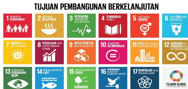
Figure1: Image Sustainable Development Goals

Sustainable Development has 17 goals and 169 targets for a global action plan in the next 15 years (effective from 2016 to 2030). Sustainable development applies to all countries (universal) so that all countries without exception developed and developing countries have a moral obligation to achieve the goals and targets of sustainable development. The following transformative objectives of sustainable development have been agreed upon globally, including: