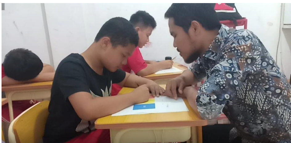
Figure 3 Sexuality education for youth with autism in the classroom