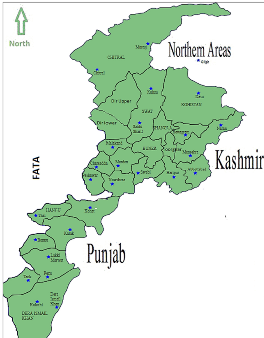
Figure 1. Map of Khyber Pakhtunkhwa province.