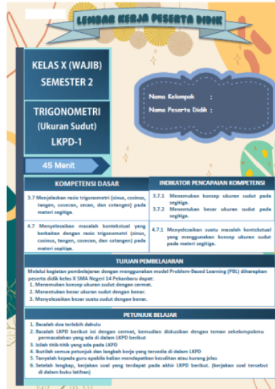
Figure 1. LKPD Introduction Display

The introduction contains several illustrations of trigonometric problems found in everyday life. Here is the view from the introduction