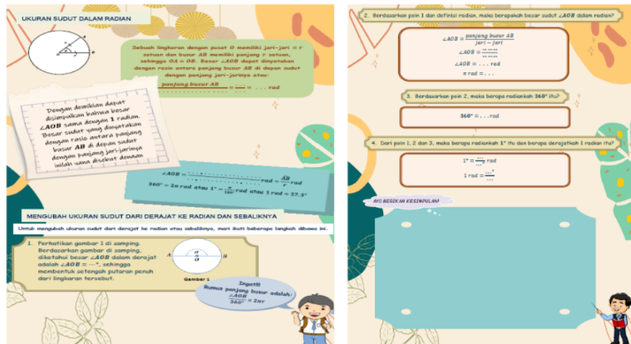
Figure 2. The display of one of the discussions on the LKPD material