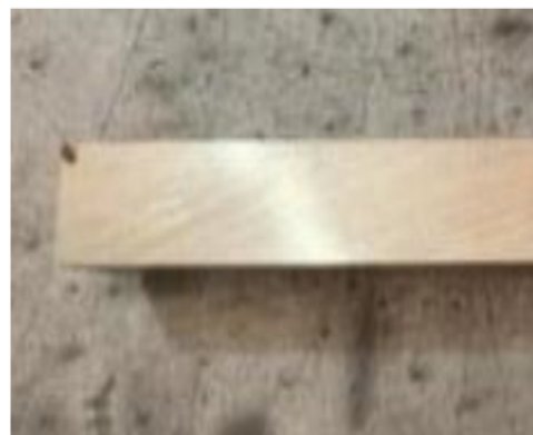
Figure 2. HSS Cutting tool.