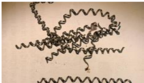
Figure 8. Continuous shape from 90° cutting tool.