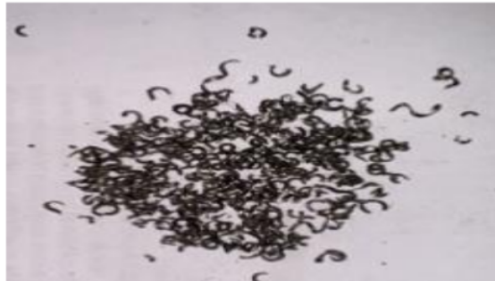
Figure 7. Discontinuous shape from 85° cutting tool.