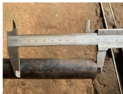
Figure 3. ST 41 steel.