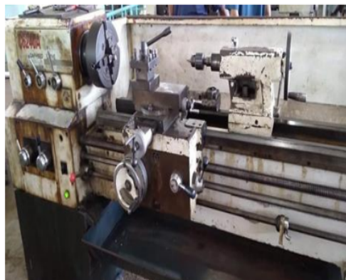
Figure 1. Turning machine type C64240A.

the electrode used in the welding process. Figure 4 shows the process of the experiment through a flowchart.