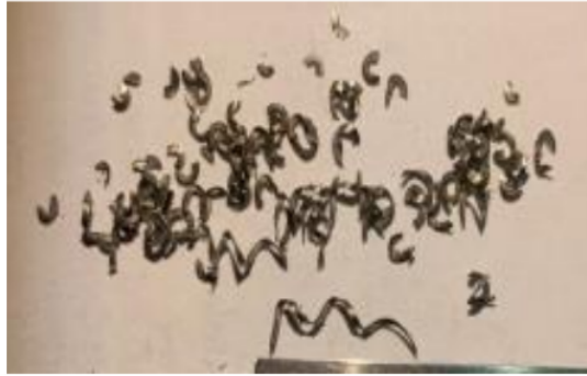
Figure 6. Discontinuous shape from 80° cutting tool.