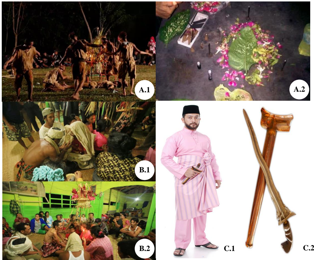
Figure 2. Traditional rituals and treatment methods connected with birds: A. Bubut/Greater Coucal ( Centropus Sinensis Stephens), B. Rangkong Gading/Helmeted hornbill ( Rhinoplax vigil Forster), C. Serindit Melayu/Blue-crowned hanging parrot ( Loriculus galgulus Linnaeus)