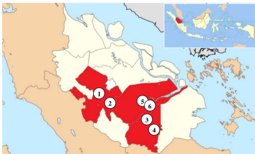
Figure 1. Research locations in Riau Province, Indonesia. 1. Kuok Village, Kampar District, 2. Gema Village, Kampar District, 3. Talang Durian Cacar Village, Indragiri Hulu District, 4. Rantau Langsat Village, Indragiri Hulu District, 5. Betung Village, Pelalawan District, 6. Kesuma Village, Pelalawan District

The research was conducted in Riau Province, Indonesia, includes Kuok and Gema villages of Kampar District; Talang Durian Cacar and Rantau Langsat villages of Indragiri Hulu District, and Betung and Kesuma villages of Pelalawan District (Figure 1). The study will be conducted from March to October 2019. Research Locations in Kuok and Gema Villages in Kampar District, Talang Durian Cacar and Rantau Langsat villages in Indragiri Hulu District and Betung and Kesuma Villages in Pelalawan District. These six villages can representatively be used to describe the use of birds in the traditional treatment process. The villages of Talang Durian Cacar and Rantau Langsat use traditional medicine from the Talang Mamak tribe led by a dukun called Balian . Betung and Kesuma villages use traditional Petalangan Malay medicine led by a shaman called Bathin . The villages of Kuok and Gema use traditional Malay Kampar medicine, led by a dukun called Dukun Tuo .