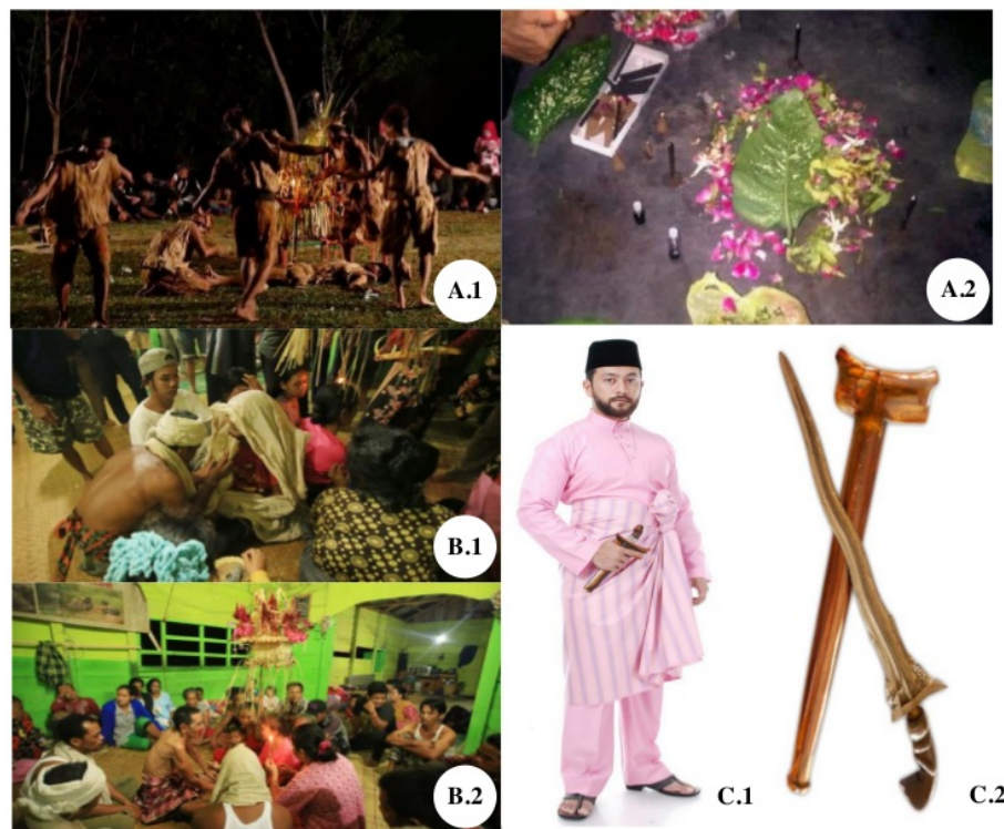
Figure 2. Traditional rituals and treatment methods connected with birds: A. Bubut/Greater Coucal ( Centropus Sinensis Stephens), B. Rangkong Gading/Helmeted hornbill ( Rhinoplax vigil Forster), C. Serindit Melayu/Blue-crowned hanging parrot ( Loriculus galgulus Linnaeus)