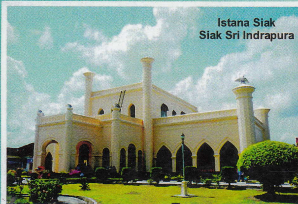
Istana Siak Siak Sri Indrapura

"Democracy, Accountability and Governance"