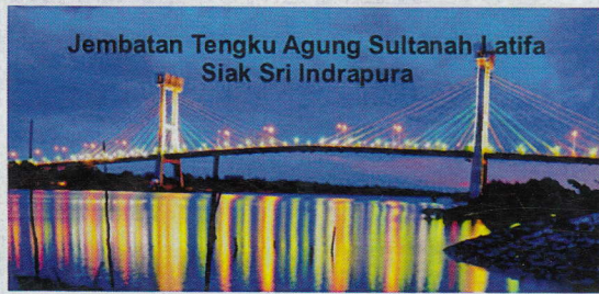
Jembatan Tengku Agung Sultanah Latifa Siak Sri Indrapura