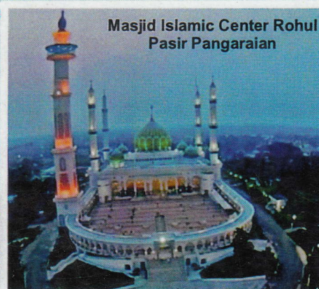
Masjid Islamic Center Rohul Pasir Pangaraian