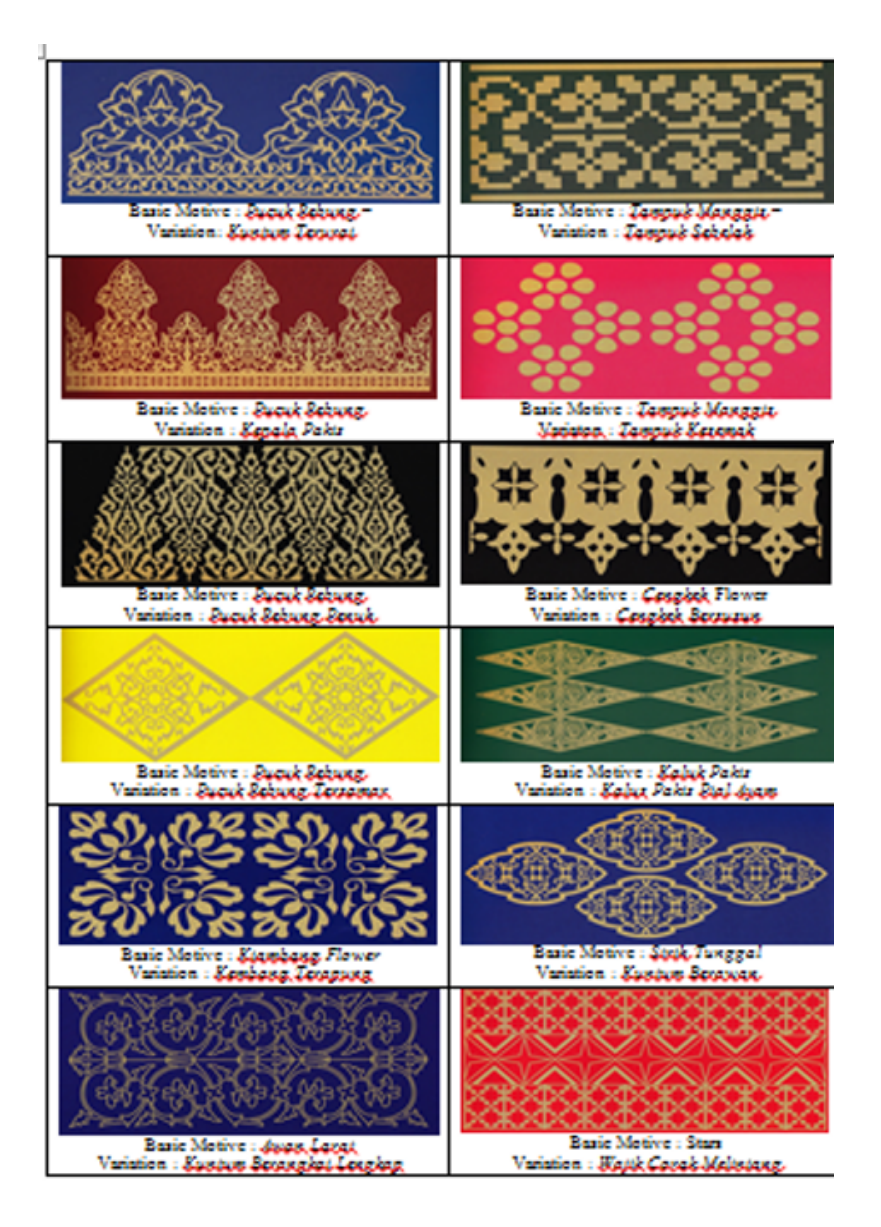
Figure 1. Basic Motives and Variation of Riau Malay Woven Source : Malik et al. (2004)

a sustainable superiority in this business so that it appears different from competitors.