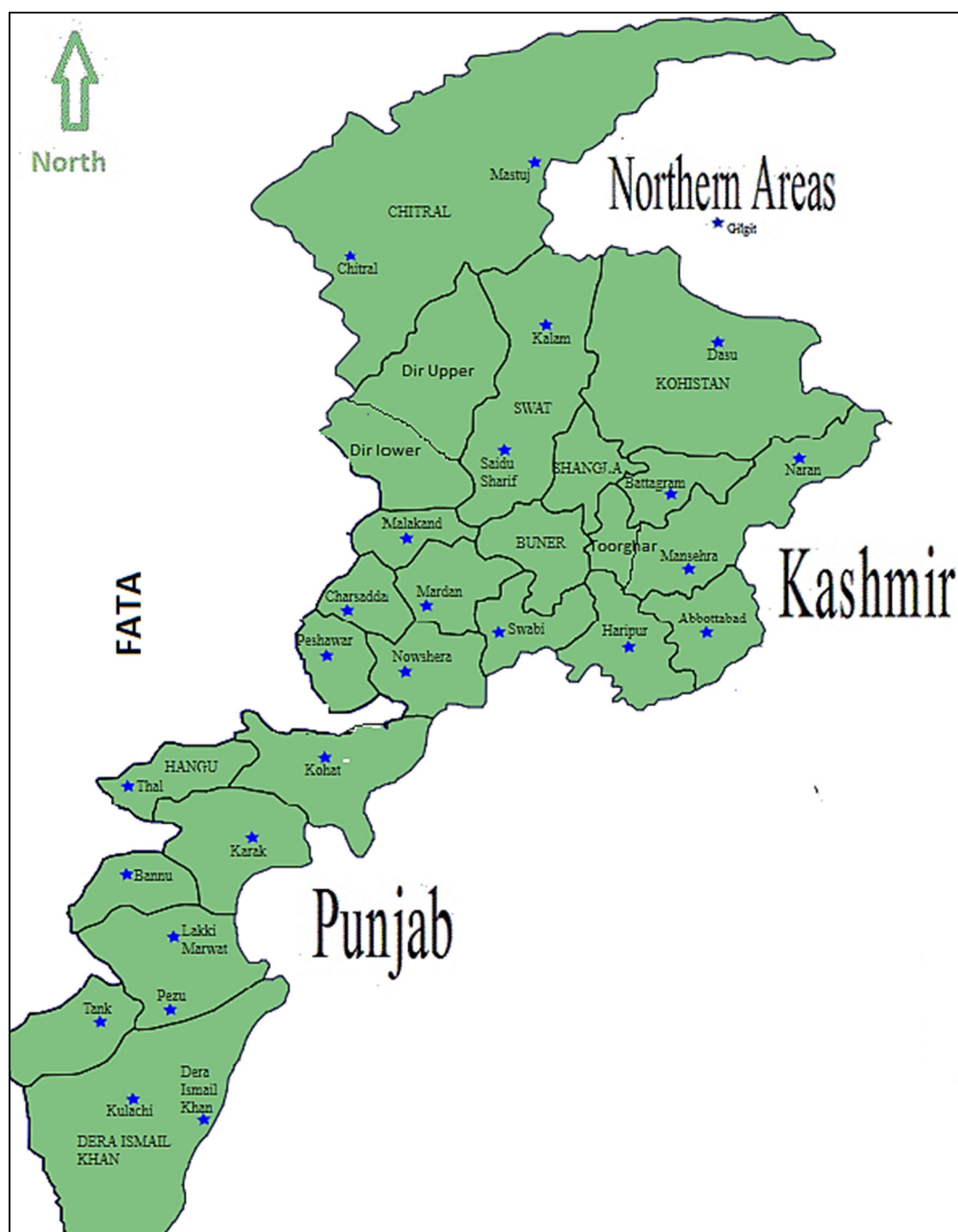
Figure 1. Map of Khyber Pakhtunkhwa province.