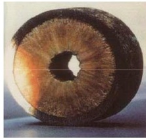
FIGURE 1. Wax precipitation reducing the effective diameter in a retrieved pipeline 2

There are several problems that could affect the oil production. One of the the problems is wax deposition 1 . Wax is a hydrocarbon compound consist of long chained of alkanes and it is often precipitates rapidly as a result of the changing temperature and pressure. Figure 1 shown the effect of wax in the pipeline.