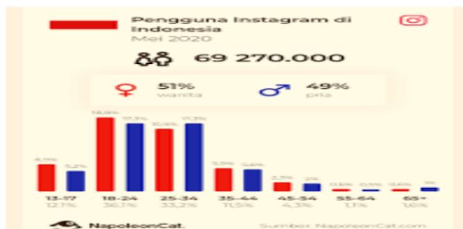
Figure 1. Instagram Users in Indonesia