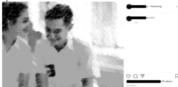
Figure 6. Informant with his Girlfriend