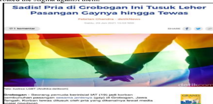
Figure 2. Gay News in the Media

Indonesia has no national law that prohibits homosexuality, except for Undang-Undang No. 1/1974 concerning marriage. This law stipulates that legal marriages are only marriages between heterosexual couples, but wider discrimination occurs in the LGBT (Lesbian, Gay, Bisexual, and Transgender) community . In the last five years, discrimination against gender and sexual minorities in Indonesia has increased. Non-governmental organizations that focus on advocacy for LGBT rights have recorded various acts of discrimination, ranging from bullying to murder. The media in Indonesia has an important role in creating stigma against the LGBT community. Anti-Gay media prejudice can be seen from the news headlines, news point of view, word choice, and the selection of their sources. This marginalization and stigma causes the gay community in Indonesia to avoid appearing in public spaces and media (Azhari et al., 2019). It was found that the gay community in Indonesia used social media to change stigma. Until now, Indonesian people continue to label homosexuality as deviant sexual behavior. Through social media, the gay community tries to fight this labeling by avoiding extreme expressions of sexuality. Through social media, the gay community denounced actions that exacerbated the stigma against them.