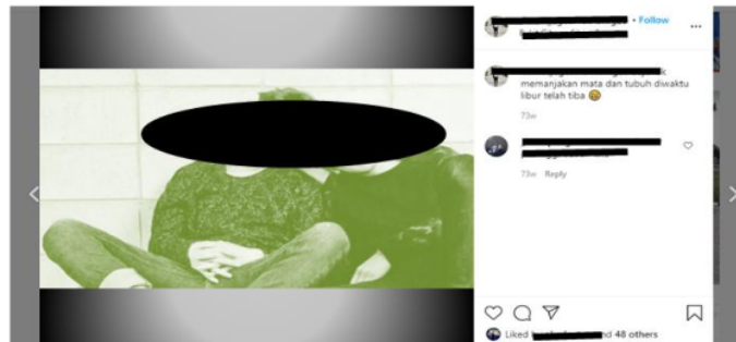
Figure 5. Close Relationship in Instagram