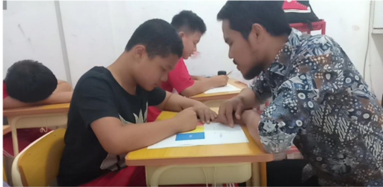
Figure 3 Sexuality education for youth with autism in the classroom