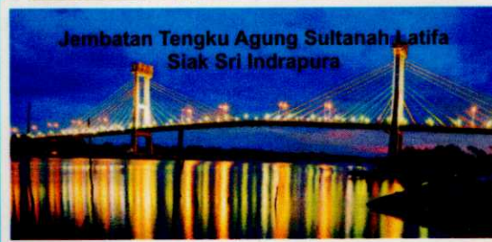
Jembatan Tengku Agung Sultanah Latifa Siak Sri Indrapura