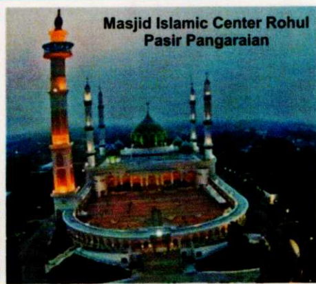
Masjid Islamic Center Rohul Pasir Pangaraian