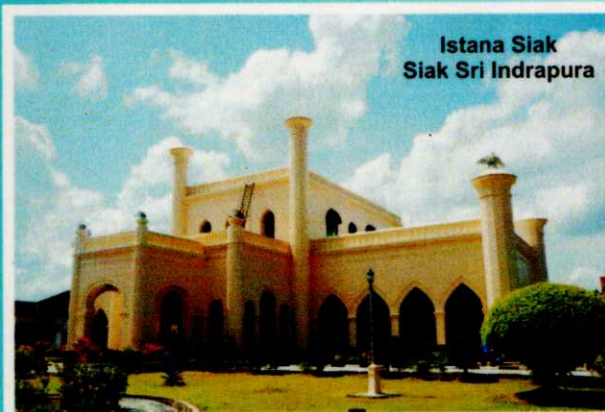
Istana Siak Siak Sri Indrapura

Pekanbaru Riau, Indonesia Thursday, November 23, 2017